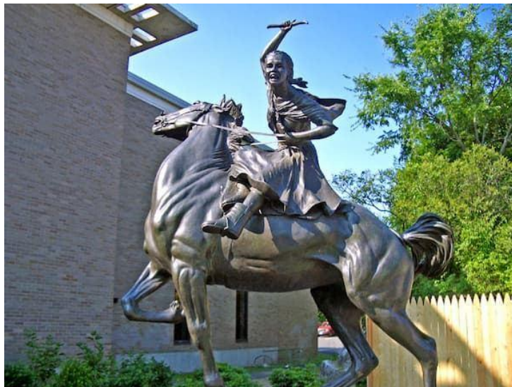
Sybil Ludington statue created by sculptor Anna Hyatt Huntington 1961